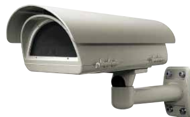
VERSO COMPACT + WBOVA2