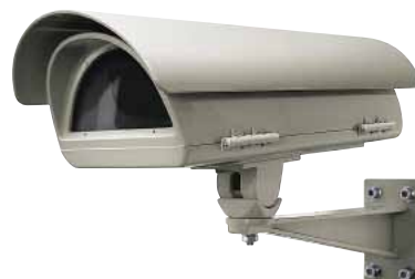
VERSO COMPACT + WBJA