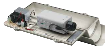
VERSO COMPACT + CAMERA